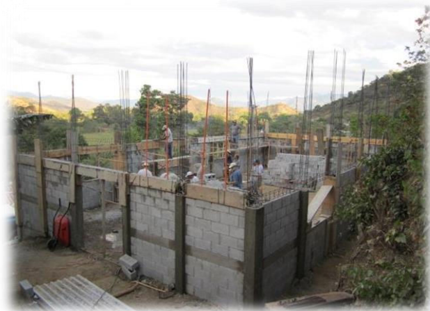
Construction of the Church building in 2014

The vision of the local leadership includes a third stage involving agricultural initiatives, water purification, opportunities for education sponsorships and more.