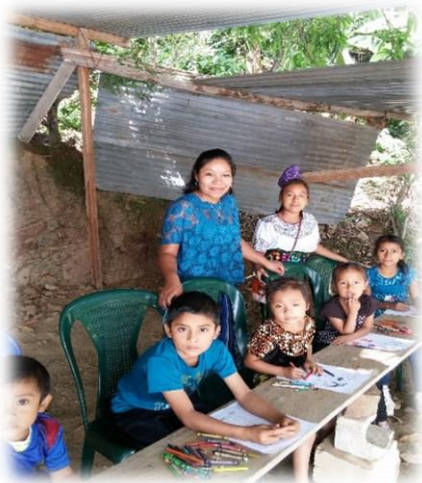
Children's Sunday School Classroom

YOUR ACTIVE INVOLVEMENT CAN IMPACT OTHERS!